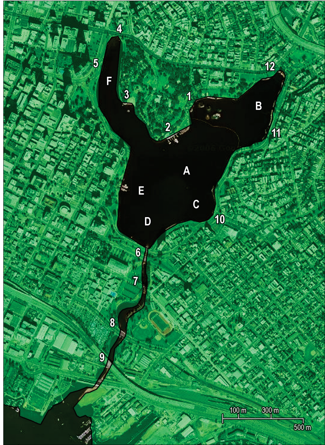
Figure 1. Sites sampled over a one month period from June to July.

In order to determine the relative health of water for the entire lake, we then created contour maps of each measure of quality (Figures 2a-2c) -- as well as the overall WQIs (Figure 3) -- using the Surfer 7.0 software by Golden Software.